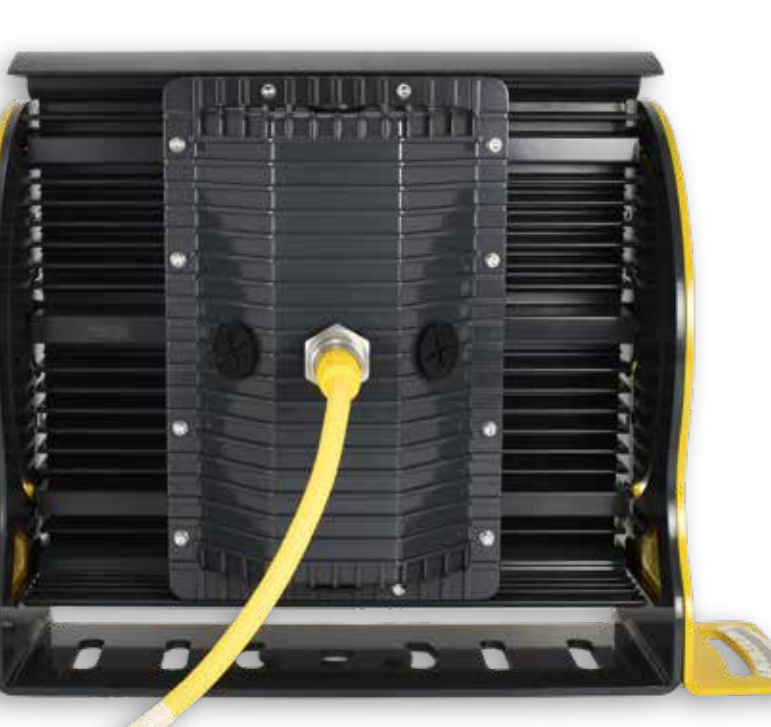
Equipped with our patented ProTrac aiming system for easy angle alignment.